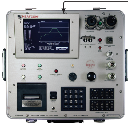
Model: HCS9000FL (Single Zone) NSN: 4920-01-462-4673

The Flightline Composite Repair Systems include the same basic features, operation and capabilities as the HCS9000 and HCS9200 systems, but are further designed to meet the requirements of Class I, Division II, hazardous environment operation per the U.S. National Electric Code (NEC), as promulgated by the National Fire Protection Association (NFPA).