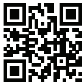
Scan for Latest Catalog and Company Information

* System requires special heat blankets for vapor volatile environments. Heat blankets must be ordered separately. Please ask your sales engineer for more information regarding Supervisory Heat Blankets.