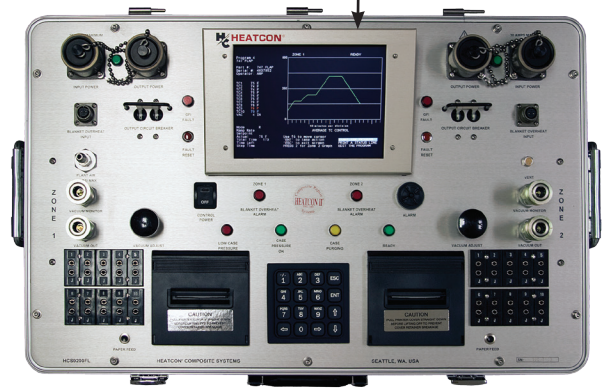
Model: HCS9200FL (Dual Zone) NSN: 4920-01-462-4675

DESIGNED SPECIFICALLY FOR HAZARDOUS AND FLIGHTLINE ENVIRONMENTS