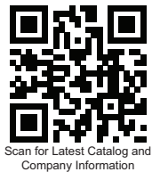
Scan for Latest Catalog and Company Information