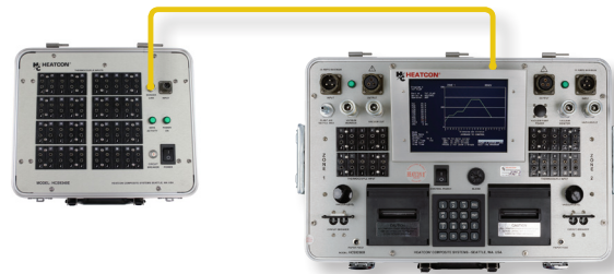
HCS9340E + HCS92000B* = 60 Thermocouple Channels

*Model HCS92000B Dual Zone Hot Bonder with Rev 18 (or later) software is required to operate the HCS9300E Thermocouple Expansion Units. HCS9200B sold separately.