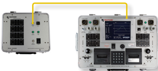
HCS9320E + HCS92000B* = 40 Thermocouple Channels

Expand thermocouple channels on the HCS9200B Dual Zone Hot Bonder with the HCS9300E Series